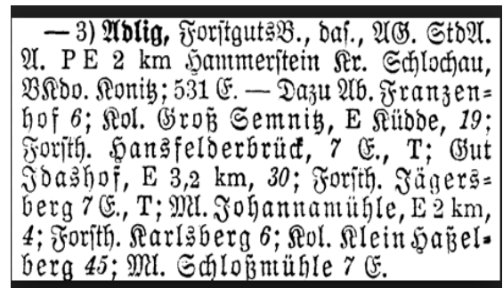
Sample from Meyer’s Gazetteer

(Sequence of these four classes may vary.)